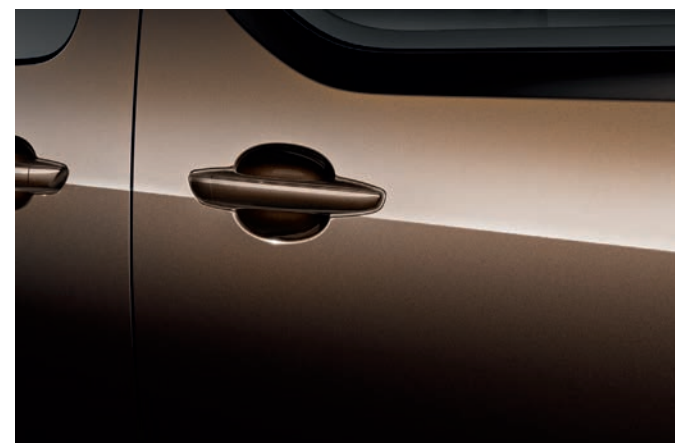
Rich Oak Brown