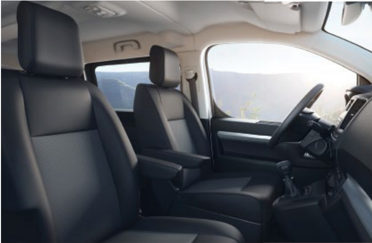
Tritone Grey fabric interior trim.