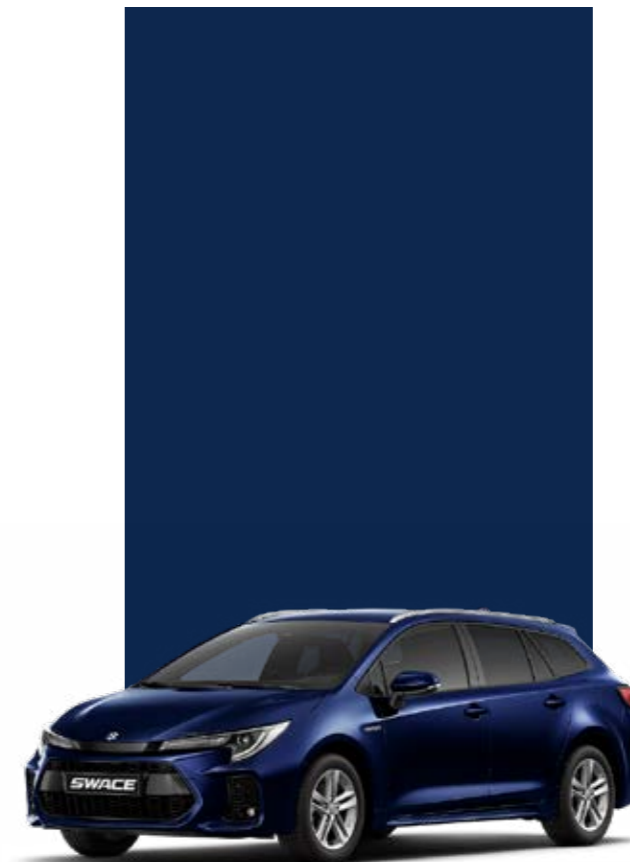
Dark Blue Mica