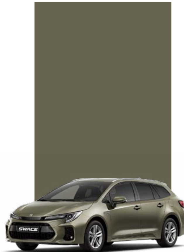
Oxide Bronze Metallic