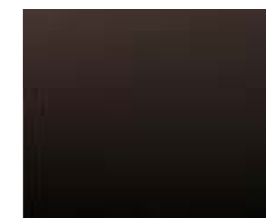
Phantom Brown Metallic